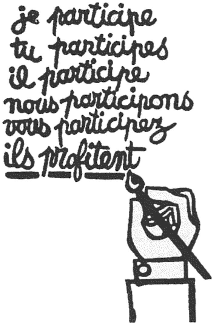
Figure 1. French student poster. In English, "I participate, you participate, he participates, we participate, you participate...they profit."

My answer to the critical what question is simply that citizen participation is a categorical term for citizen power. It is the redistribution of power that enables the have-not citizens, presently excluded from the political and economic processes, to be deliberately included in the future. It is the strategy by which the have-nots join in determining how information is shared, goals and policies are set, tax